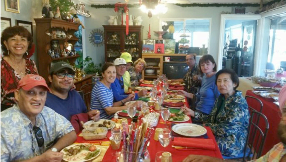
Chinese New Year party-2016