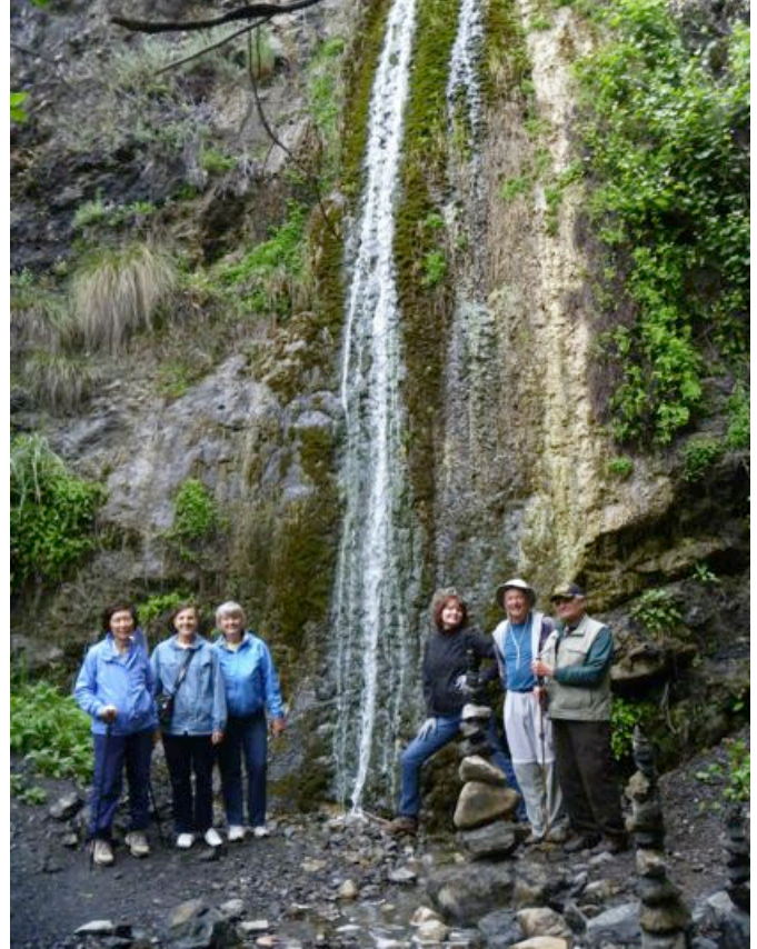
Trabuco Canyon Falls