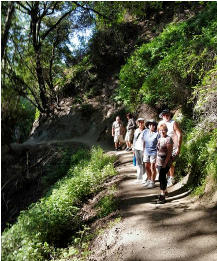
Trail up to Monrovia Falls